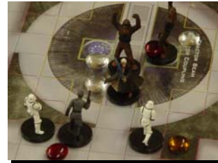
Let the Wookiee Win!

involved with rather cool looking Star Wars models.