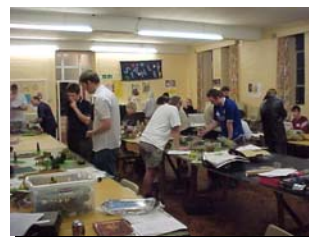
A busy club night

Please try and have an army list when you play. There is nothing worse than suspecting your opponent has too many points or is using movable war gear or magic items. A clear army list avoids this and a professional looking list is free at Gobstyks, using army builder on the club computer.