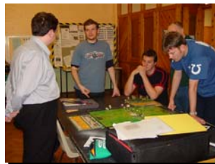
Games often have players with a variety of experience offering advice. A great place to learn.