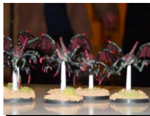
They came from above!

If you feel that you can achieve Silver Membership then the first thing you need to do is become a member! Simply attending 50% of the meetings over a six month period to qualify then 50% over 12 months to maintain your membership. Then see Will with your army and check the criteria on the notice board or web site.